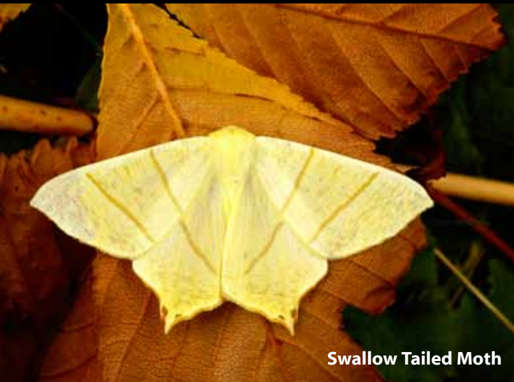
Swallow Tailed Moth

North York Moors and Coast LEADER project Ryedale District Council NY Moors Lime and Ice Project